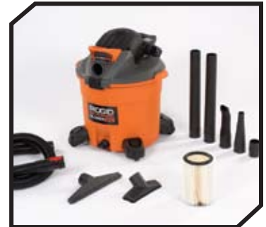
Vac with Accessories & Filter