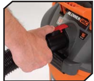
Tug-A-Long® Locking Hose