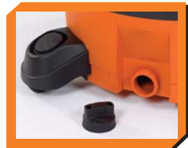
Large Drain for Emptying Water