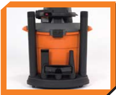
Accessory Storage Caddy